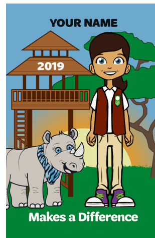
Custom Avatar Patch