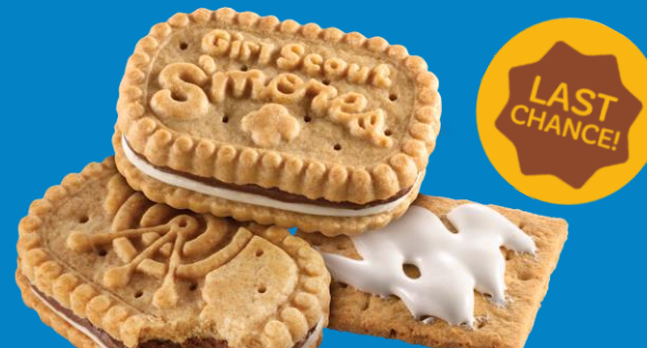
Girl Scout S'mores®